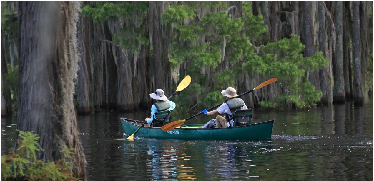
Trek Crew 190617-01A-ST paddling on their first day in the swamp.