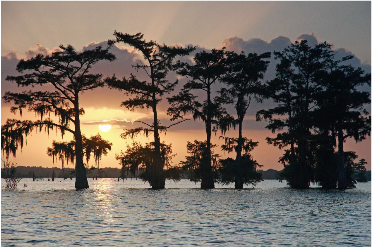
Sunset from the Floating Pavilions in the Henderson Lake area of the Atchafalaya Swamp.

From its majestic cypress and tupelo covered wetlands to the egrets and alligators inhabiting its skies and waterways, the Atchafalaya embodies swamp life in Louisiana. Pronounced “uh-CHA-fuh-LIE-uh,” the Atchafalaya gets its name from the Choctaw phrase for “Long River.” An unmatched American wonder, the Atchafalaya encompasses 1.4 million acres between Lafayette and Baton Rouge, LA. As the nation’s largest river swamp, the Atchafalaya serves as an important distributary of the Mississippi River Valley, relieving some 30% of the big river’s flood waters before they reach critical ports in Baton Rouge and New Orleans. The water that is directed down the Atchafalaya River through the swamp spillway flows through an ever-changing landscape of hardwood forests, farmlands, swamps, and marshes on its way to the Gulf of Mexico. As one of only six land developing river deltas, and the only such delta in North America with stable coastal wetlands, the Atchafalaya is a critical feature of the sustainability systems of Louisiana’s wetlands and the Gulf Coast.