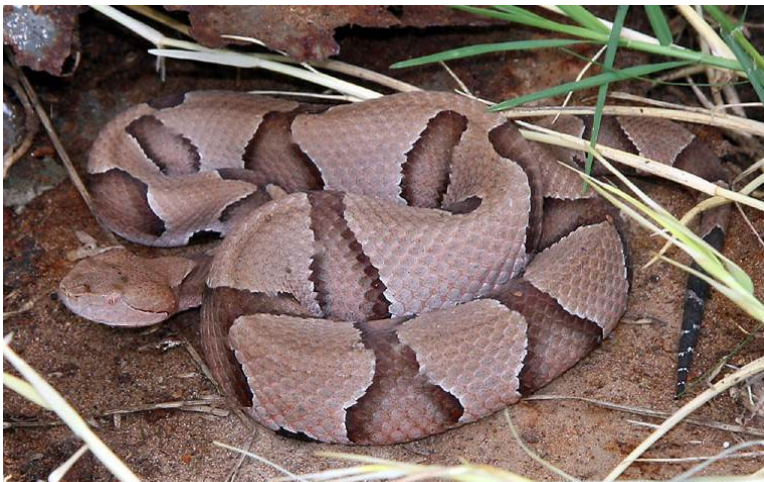
Copperheads prefer to live in wooded areas, near fallen trees, and around streams or ponds.