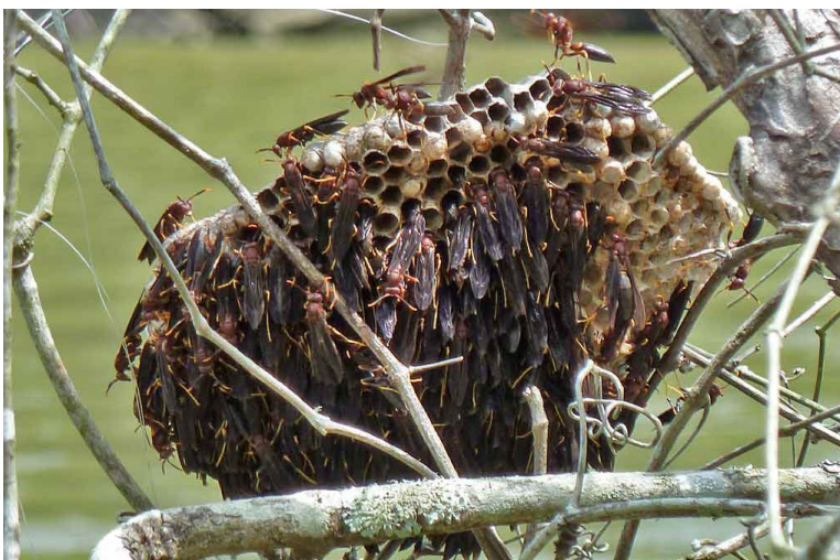
Undisturbed, nests in the swamp can become the home for hundreds of wasps.

If a crew member is sensitive or allergic to wasp/bee stings, be sure the individual carries their anaphylaxis kit (bee sting kit) with them. In some cases, wasp nests are built on low lying tree branches. Attention must be paid when paddling amongst trees, as to not disturb the nests. By no means should participants use their paddles to hit a nest. This type of activity can place the whole crew in trouble if people are stung or forced into the water. If crew members are sensitive to other insect or spider bites, make sure to have an antihistamine or a doctor recommended drug along. Insect repellent and proper clothing is recommended for protection against horse flies and mosquitoes.