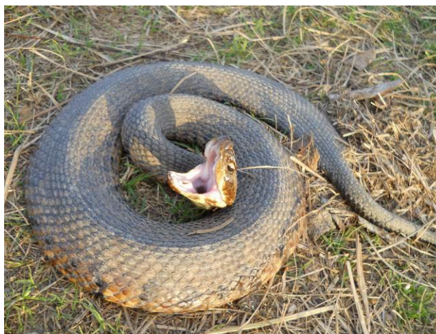
Cottonmouth snakes spend the majority of their life on or around water.