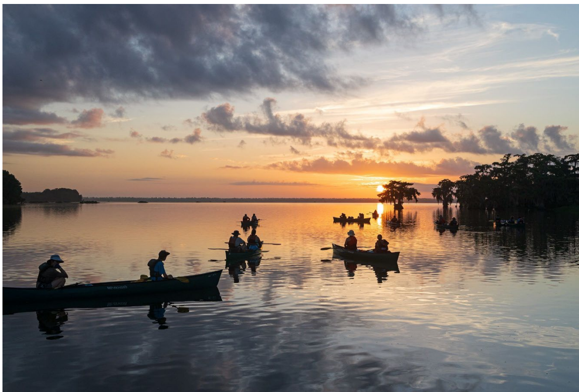
Scouts watch the sunrise over Sandy Cove in the early morning hours of Day 5.

IMPORTANT: Swamp Base requires two adult leaders on all treks. All trek crews participating in Swamp Base must have at least two adult leaders . For Troops, one of the adults must be over the age of 21; the other must be at least 18 years of age. For Venturing Crews, both leaders must be at least 21, and if the Crew is co-ed, you must have co-ed leadership. If you have more than one trek crew attending, each trek crew must have at least two adult leaders.