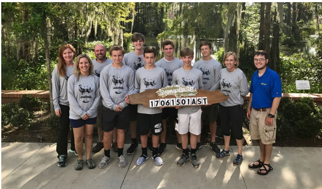
Trek crew 170615-01A-ST from the Sam Houston Area Council in Texas.

Upon arriving to Lafayette, LA, Swamp Base participants need to meet at the Wingate by Wyndham Hotel in Lafayette at 2:00 pm to begin their Swamp Base experience. The Wingate is located at 702 E Kaliste Saloom Rd. Scouts will be assigned a room for the night and have their trek guide complete their trek orientation, safety overview, and gear shakedown. Please see the 'Trek Gear List' for a complete list of required and recommended gear.