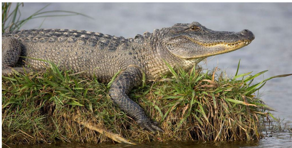
Alligators can be found throughout the trek. Always practice caution when in or on the water.