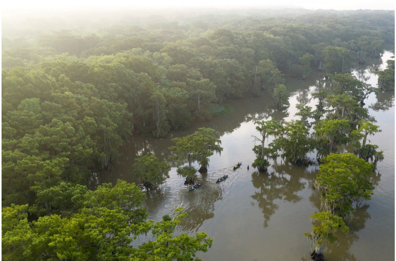
Scouts paddling through the ancient cypress trees of Lake Fausse Pointe on the final day of their trek.

For Scouts, the Atchafalaya presents the ideal adventure. Scouts will test their abilities and determination as each one of their senses soaks up the swamp's sights, sounds, textures, and flavors. Where the casual outdoorsman sees impassable bogs, frightful wildlife, and the daunting unknown, we Scouts see opportunities to learn, to appreciate, and to have fun!