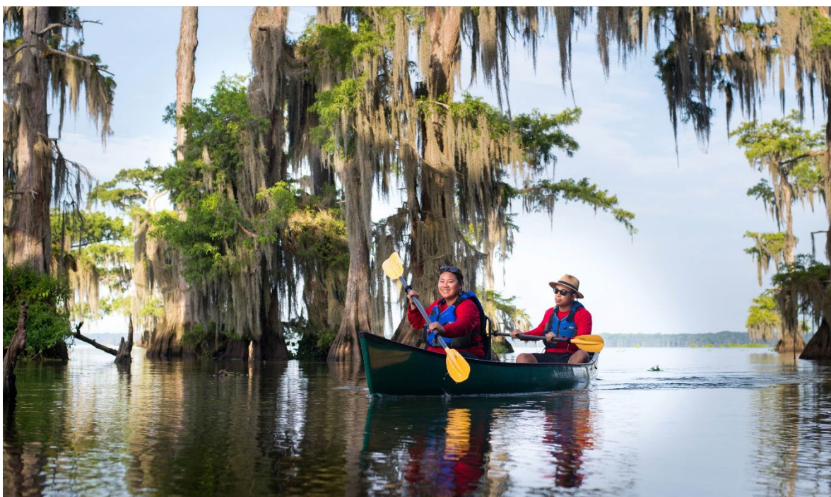
Morning paddle through the cypress trees of Lake Fausse Pointe on Day 5's paddle.