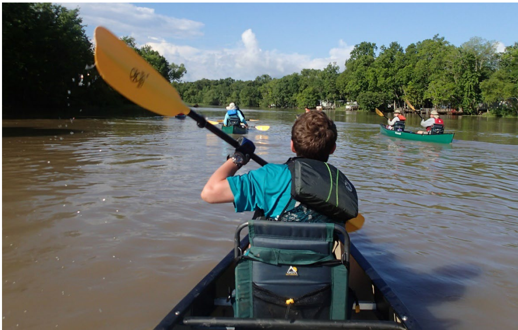
Canoeing through Bayou Alexander on the way from Rougarou Island to Camp Atchafalaya.