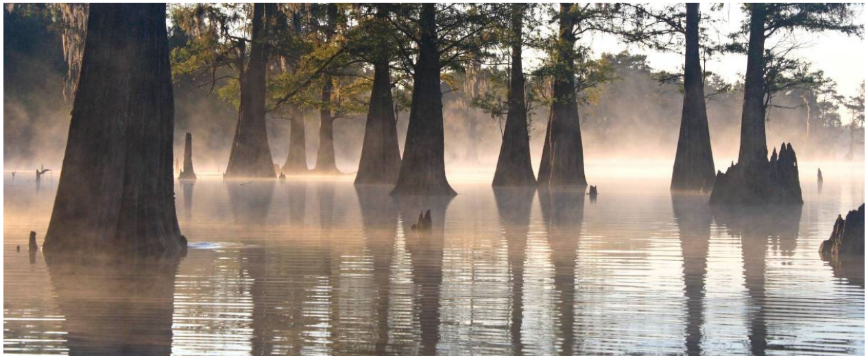
Misty Bayou Benoit morning.

Bless the waters that bring life to this land. Bless this journey to see the swamp firsthand. Bless the birds, the fish, and the trees. Bless this food that strengthens me. Bless the friendship and fellowship we feel, As we gather in the swamp for this meal. Amen.